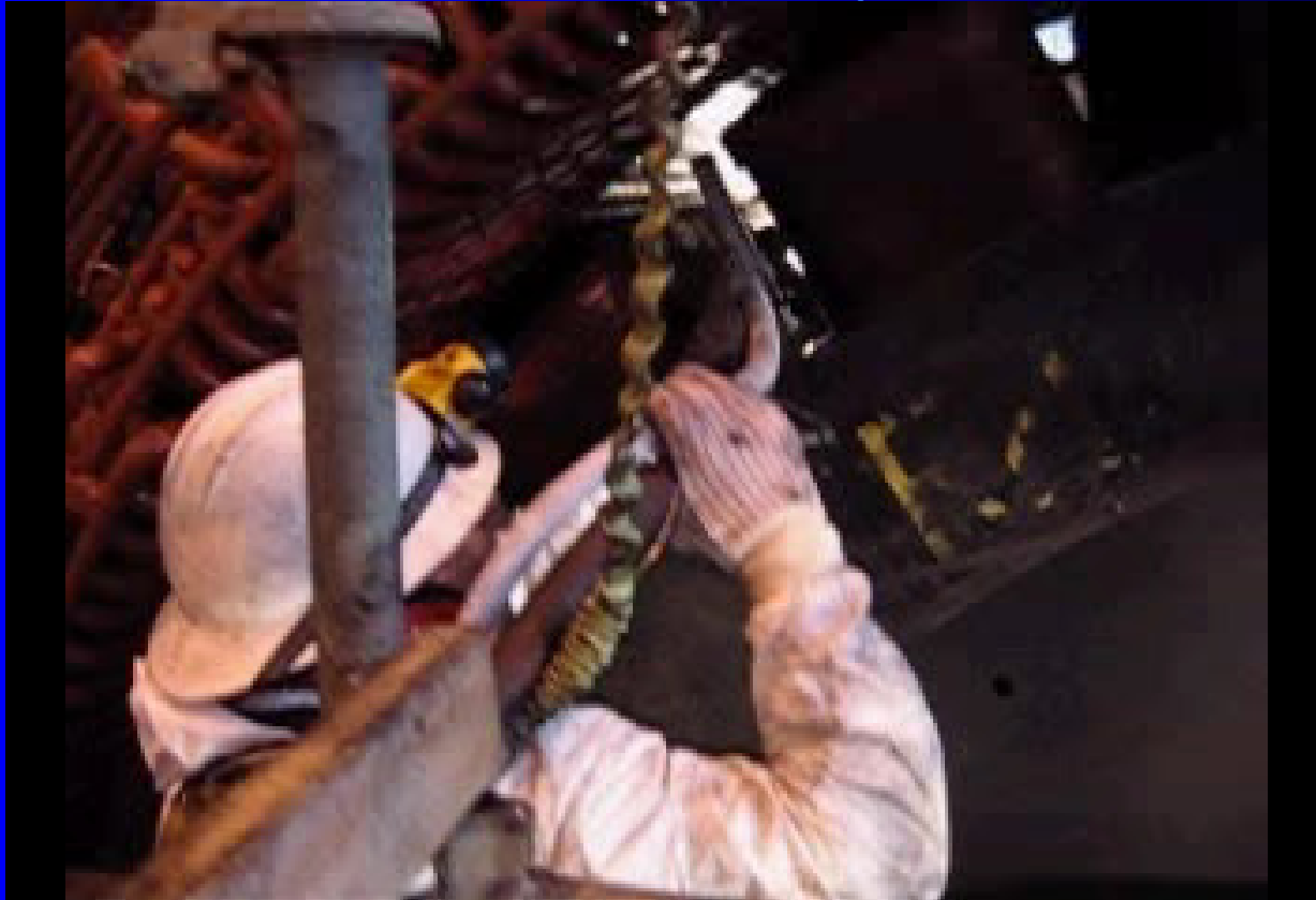
Cleaning Hydro-Electric Turbine