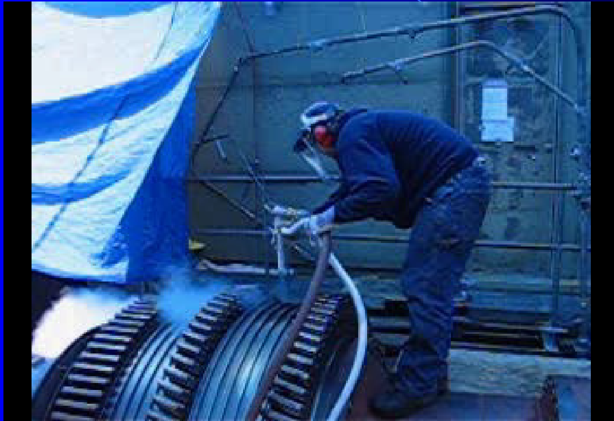
Cleaning Turbine Dovetails