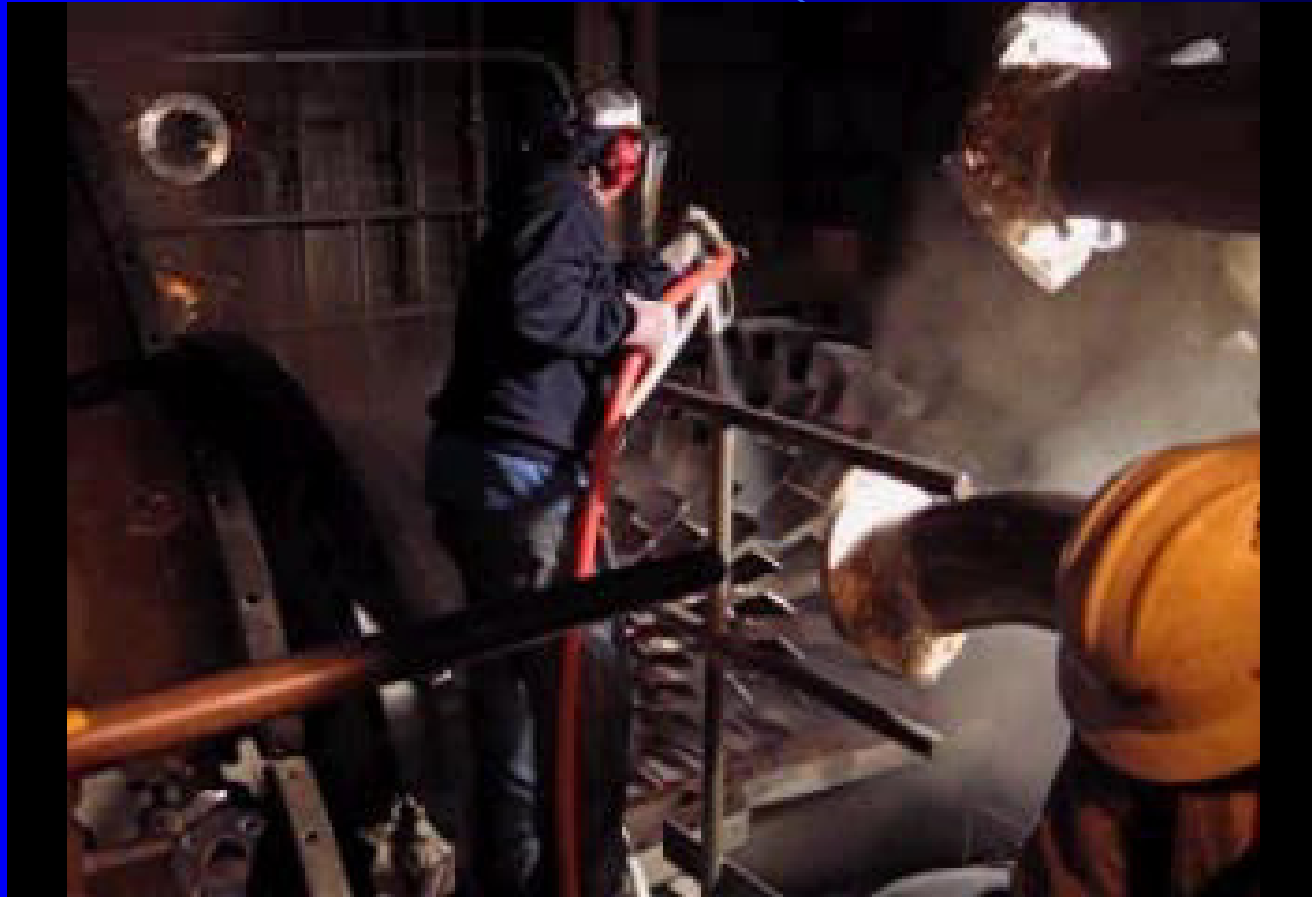
Cleaning Turbine Blades